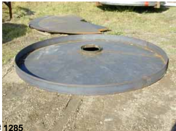
Part # 1285

Free Form Plastic Products Box 159, 502 F.P. Bourgault Drive St. Brieux, Sask. S0K 3V0 PH: 306-275-2155 FAX: 306-275-2101 E-mail: sales@freeformplastics.com www.freeformplastics.com